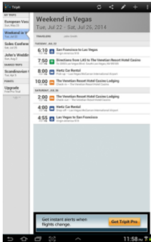
Screenshot of Tripit